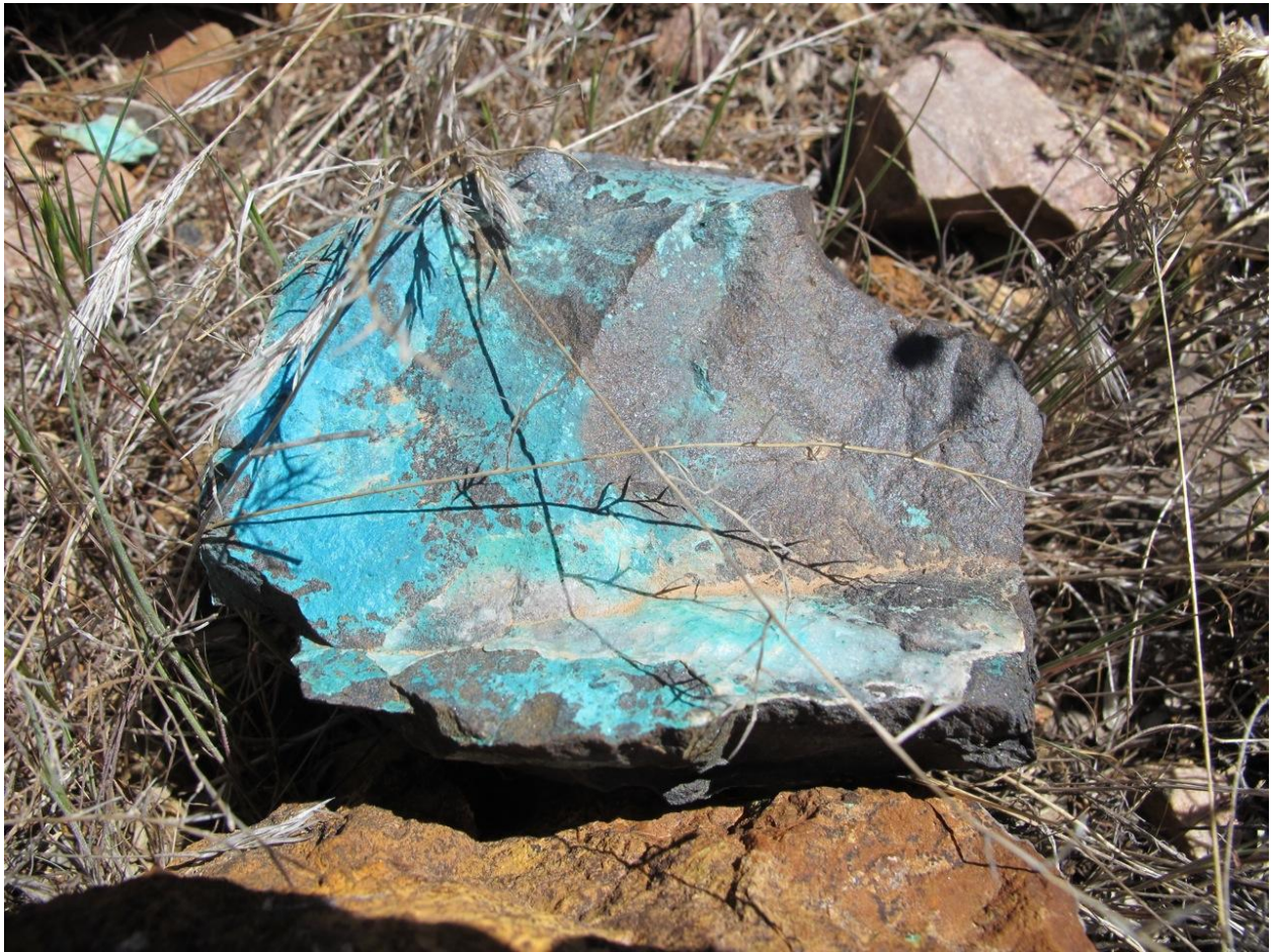
Photo of copper mineralization from the Black Copper Vein